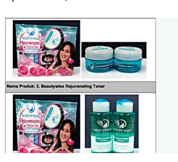
Health Ministry warns against buying, using these two cosmetic products |... New Straits Times

Why People Are Using These Feng Shui Bracelets and How They Can Help You Sponsored | Power Bracelet