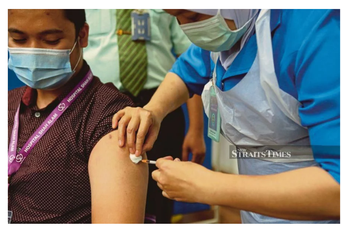
Vaccine scepticism and hesitancy should be gotten rid of if we really care for our lives, our country and most importantly, our loved ones.