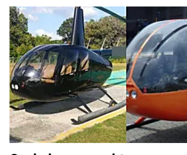
Cash, luxury yacht, helicopters seized from head of 'project tender... New Straits Times