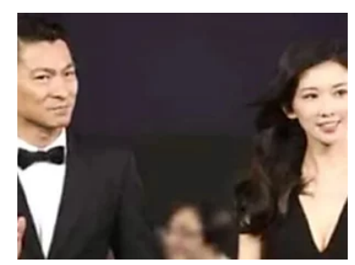
#Showbiz: Andy Lau opens up about Msian wife on social media | New Straits... New Straits Times